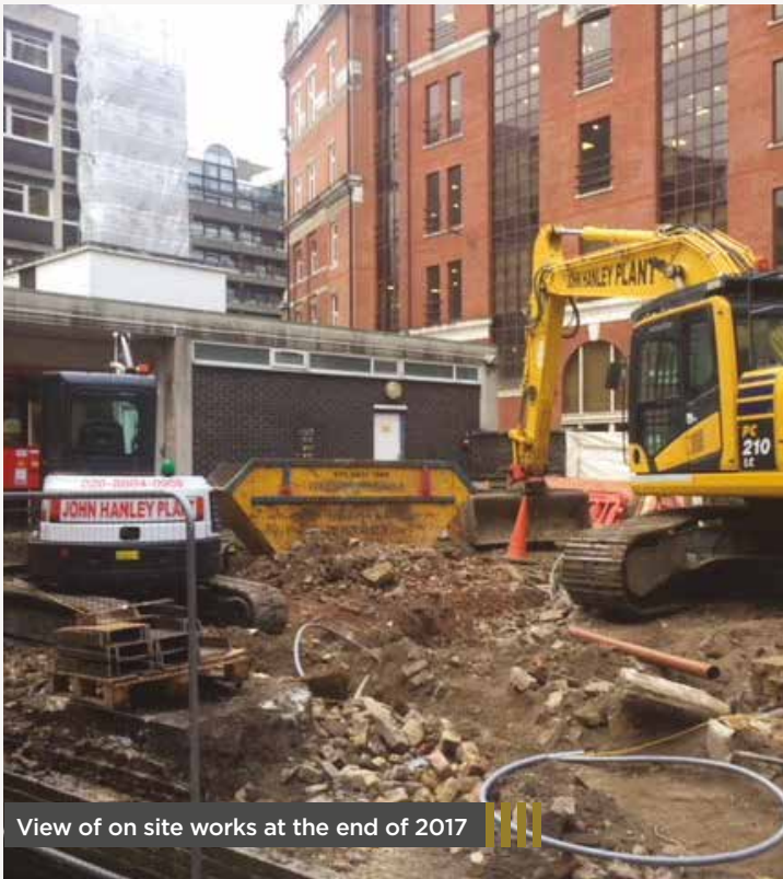
View of on site works at the end of 2017