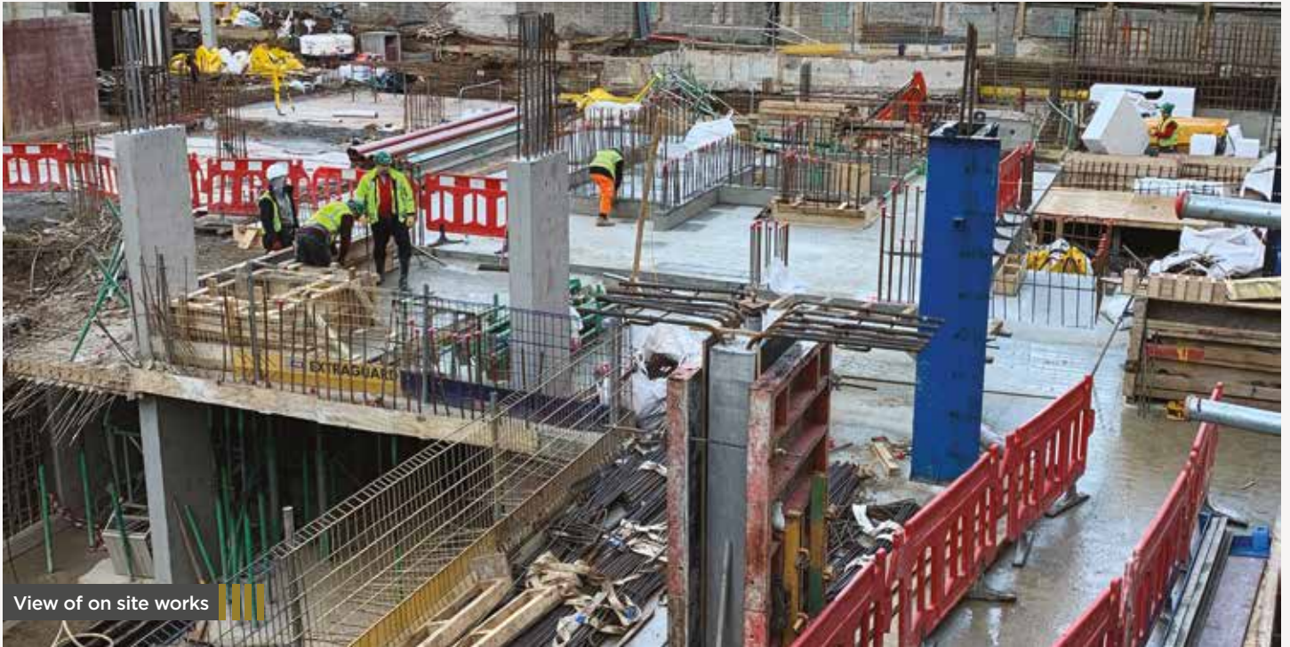
View of on site works